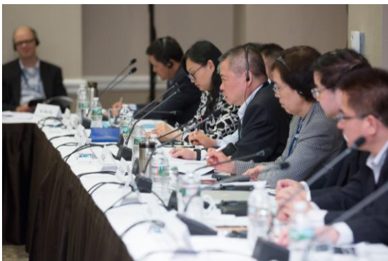
In 2016, USTDA conducted 9 reverse trade missions to introduce Chinese public and private sector officials to U.S. best practices and advanced technology solutions.

By adapting to the evolving needs of China's market and closely coordinating with Chinese decision makers, these public-private partnerships have achieved long-term success. Specifically, the partnerships are providing increased market access for U.S. companies and advancing U.S. policy interests including climate change and aviation safety and security.